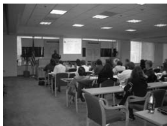
Lydia Bourne discusses current Legislation